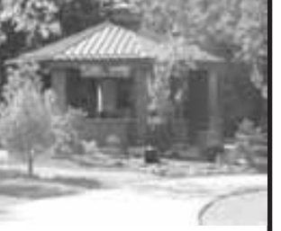
Plan today, for peace of mind tomorrow